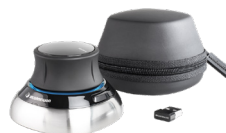
3DCONNEXION SPACEMOUSE WIRELESS

Bring your ideas to life with the groundbreaking new workspace tool that uses an intuitive touch screen, pen and totem to enable natural digital creation.