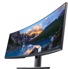
DELL ULTRASHARP 49 MULTI-CLIENT MONITOR | U4919DW

3Dconnexion's patented 6-Degrees-of-Freedom (6DoF) sensor is specifically designed to manipulate digital content or camera positions in the industry-leading CAD applications. Simply push, pull, twist or tilt the 3Dconnexion controller cap to intuitively pan, zoom and rotate your 3D drawing.