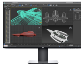
DELL ULTRASHARP 27 ULTRATHIN MONITOR | U2719DC

Work at full speed with Dell's powerful Thunderbolt Dock. Charge your system faster, support up to three 4K displays and connect to your peripherals via a single cable.