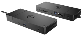
DELL THUNDERBOLT DOCK | WD19TB

Work at full speed with Dell's powerful Thunderbolt Dock. Charge your system faster, support up to three 4K displays and connect to your peripherals via a single cable.