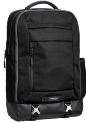
DELL TIMBUK2 AUTHORITY BACKPACK - 15"

Connect your Precision to almost any device with a convenient 6-in-1 compact adapter and collaborate from any location.