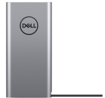
DELL NOTEBOOK POWER BANK PLUS - USB C, 65WH

Designed specifically for Dell, the Timbuk2-Authority backpack is built to carry and protect everything you need for the workday. The internal organizer provides ample space for laptop accessories and any extra items you need to carry.